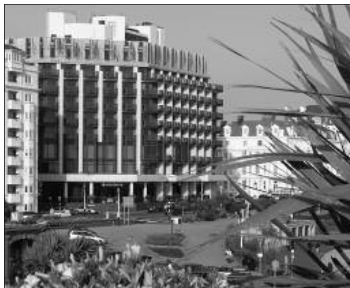
Conference Centre, Eastbourne