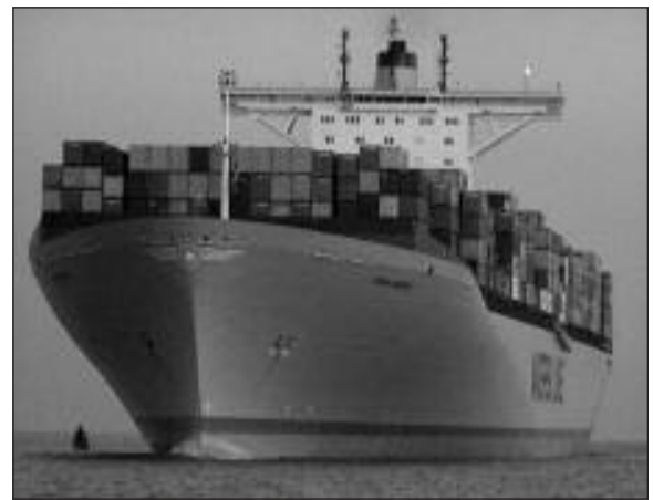
Rounding Landguard Point at dusk