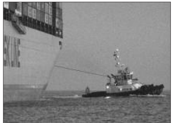
Shotley aiding the turn using indirect towage