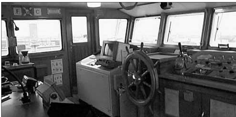
Typical cluttered bridge