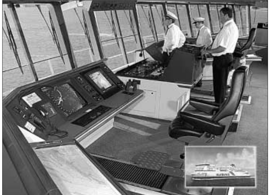
A modern integrated ferry bridge