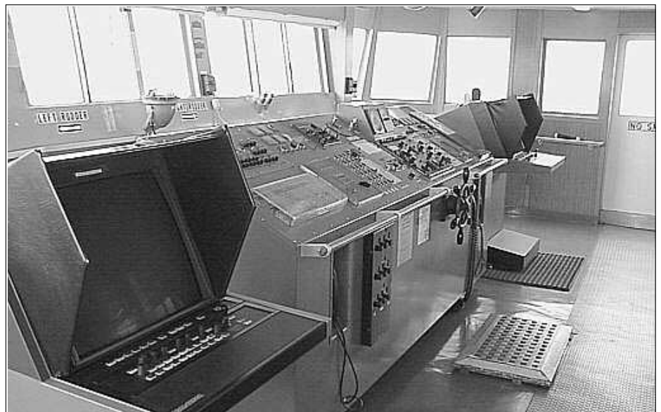
A typical 1990s "modern" layout, still popular!

I was very disappointed that I was unable to be released from my piloting roster to attend this seminar but I have copies of most of the papers presented and the Institute's own official report issued following the event. The presentations were