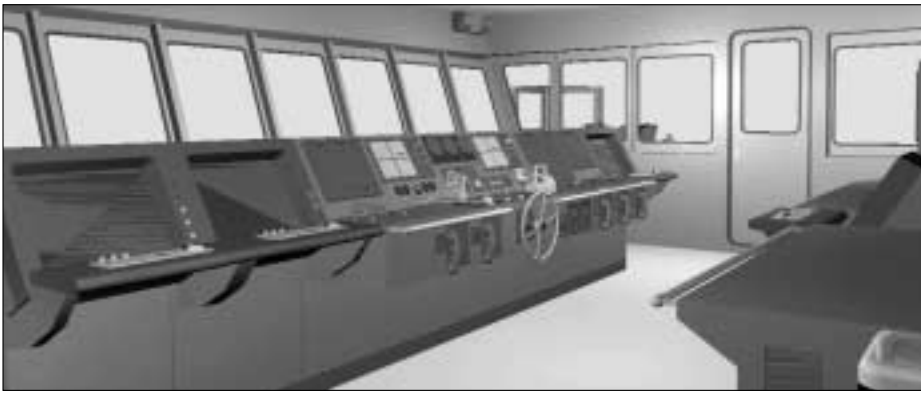
A modern bridge console. A good example of poor layout

plonked in the middle of the wheelhouse with engine controls on the right, the autopilot and helm controls in the middle and the radar on the left. The VHF was rarely integrated into this unit being usually placed on the sides of the chartroom enclosure, still located to the rear of the bridge. This layout is still to be found on newbuilds especially on vessels constructed in the far east which despite being at the forefront of microtechnology for domestic equipment rigidly sticks to 1970's style equipment and layouts even to the extent of encasing modern daylight radars (with a preference for traditional green on black displays which cannot be seen in sunlight) in traditionally styled pale green housings. Yet another of the world's great unsolved mysteries!