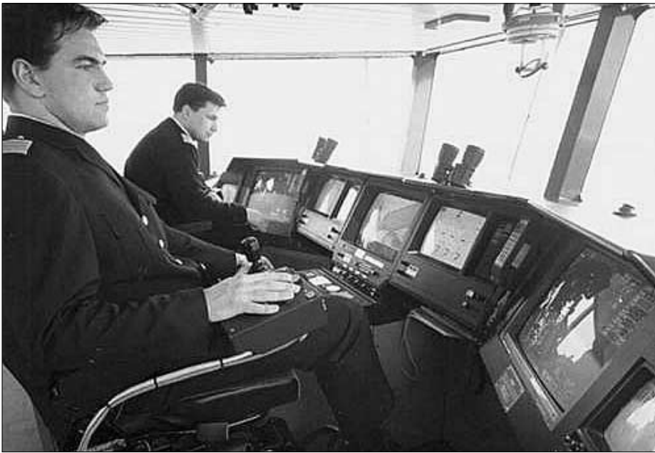
A modern fully integrated bridge, still far from ideal!

There was unanimous agreement that training in the use of complex systems was essential but sadly lacking. A few top companies did ensure that all their officers were sent on training courses and given familiarisation time on "hand-over" but these were the exception.